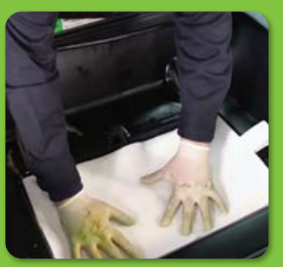
The OzzyMat® The microbe-infused mat traps particulate matter larger than 50 microns. It is disposable and easy to change. The microbes in the mat are activated when used with OzzyJuice®. Change mat every 30 days for optimal performance.