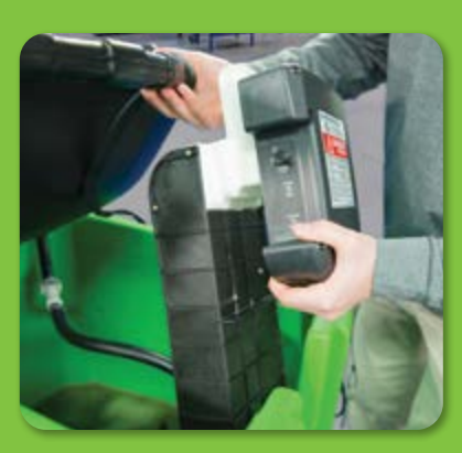
Recirculating Pump Sump action recirculates system fluid and microbes through machine.