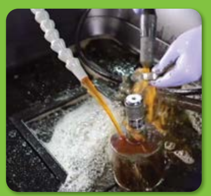
Flexible Faucet Bendable design allows user to aim fluid stream directly at greasy, dirty parts.