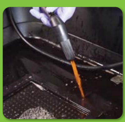
Flow-Through Brush Scrub away grease and oil with the durable brush.