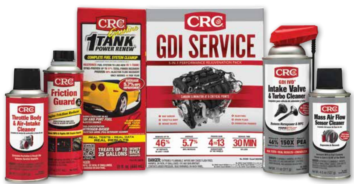
5 Premium CRC GDI Service Products in 1 Convenient Pack!